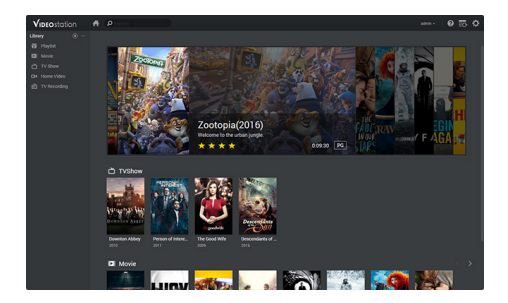
Personal Multimedia Bank

Real-time video streaming provides hassle-free and high-quality video playback among various devices.